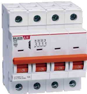
BKJ63N 3P +N