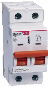
BKJ63N 1P +N